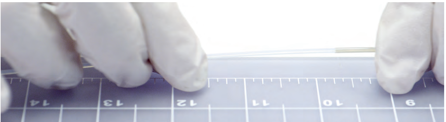
Liner Comparison Brochure

StreamLiner™ and StreamLiner™ OTW may be shipped with product labels that feature VT, XT, or UT size designations. VT represents a standard nominal wall thickness of 0.00075" (0.01905 mm). XT represents a standard nominal wall thickness of 0.0005" (0.0127 mm). UT represents a standard nominal wall thickness of 0.0004" (0.0102 mm)