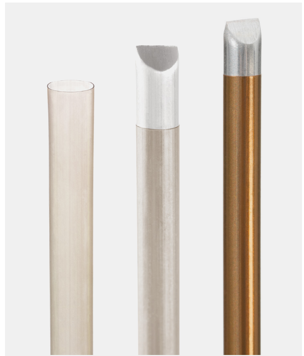
StreamLiner™ Series catheter liners are available in multiple configuration options.